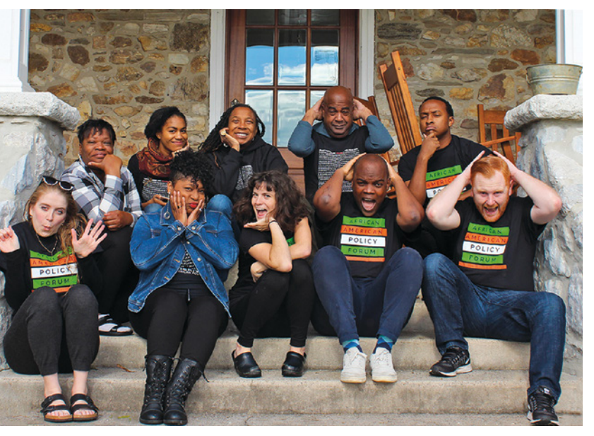
Kimberlé Crenshaw with AAPF and CISPS staff in New York, January 2019

"Throughout history, black feminist frameworks have been doing the hard work of building the social justice movements that race-only or gender-only frames cannot."