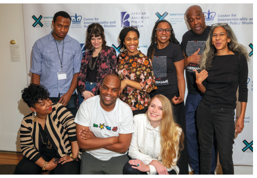
Kimberlé Crenshaw with staff in New York, January 2019

"The 'othering' of black women's sexuality has long been a part of American history. (...) This stereotype has rationalized sexual abuse as culturally-sanctioned byplay between male predators of all races and black female victims."