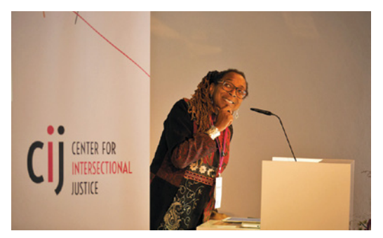
Kimberlé Crenshaw at CIJ Inauguration Conference in Berlin, September 2017

"If you look at women of color, especially blacks and Latinas, their economic well-being has been most impacted by deindustrialization, and by the de-funding of the public sector. So if any group had a reason to respond to scapegoat politics, you would think it might be those workers (...) Yet they were least likely to vote for someone not of the establishment."